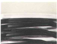
Satin with Black