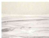
Satin with Clear