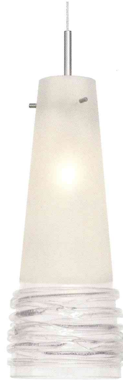
Shown with Satin with Clear Shade with Satin Nickel Hardware

ADDITIONAL INFORMATION No two shades are exactly alike. There will always be variations, which are typical of a handmade product and contribute to its beauty.