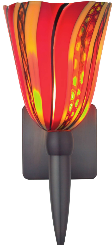
Shown with Red Shade with Dark Bronze Hardware

No two shades are exactly alike. There will always be variations, which are typical of a handmade product and contribute to its beauty.