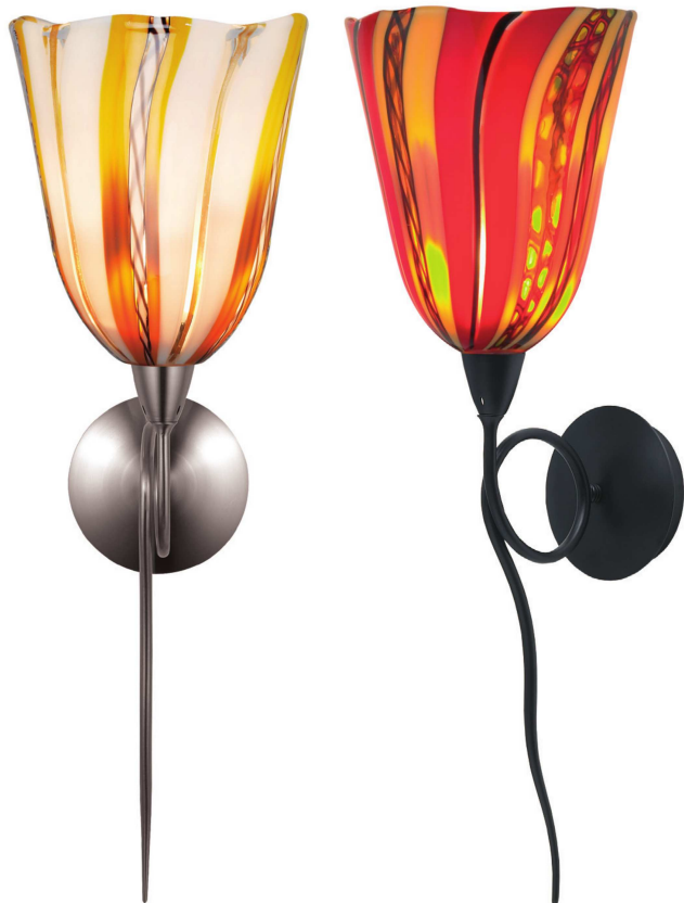
Shown with White Shade with Satin Nickel Hardware

No two shades are exactly alike. There will always be variations, which are typical of a handmade product and contribute to its beauty.