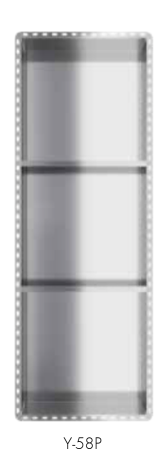
Dimension in inches