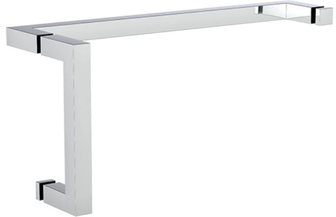
Offset Door Handle Shown with no Rosette