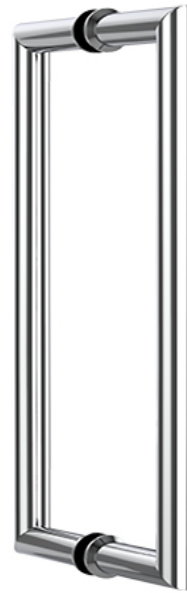
Double Door Handle shown with a small Rosette