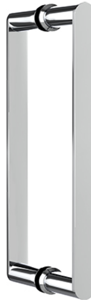
Double Door Handle shown with a small Rosette