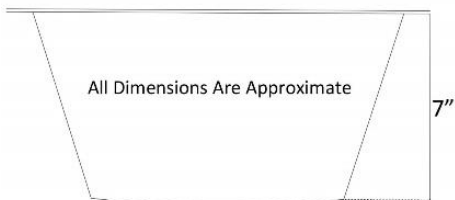
All Dimensions Are Approximate