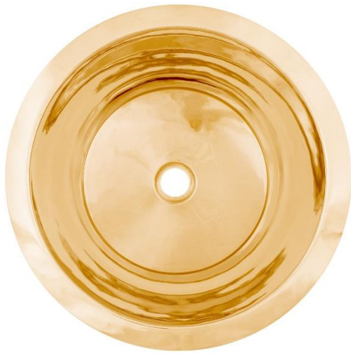
Shown in PB

NOTE: Due to the handmade nature of the sink variations in the smooth metal may be visible.