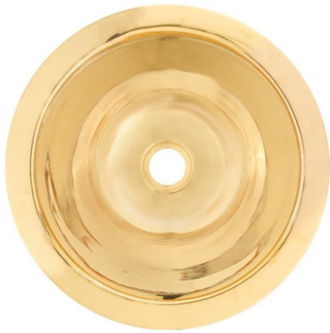
Shown in PB