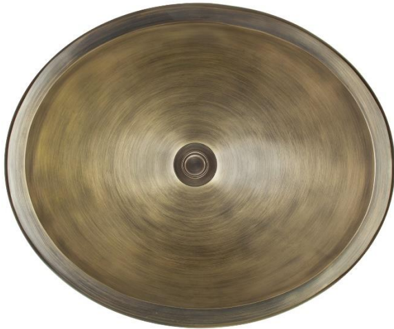
SHOWN IN AB

Linkasink warranties our product to be free from manufacturing defect for the life of the product. Warranty does not cover improper care or abuse/neglect, or changes to the living finish.