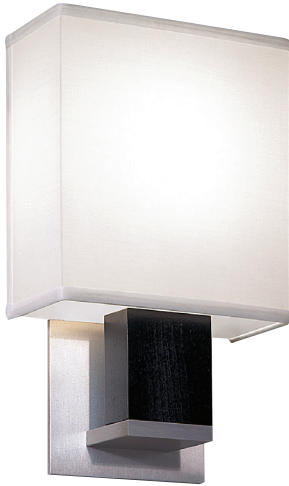
Union Single Sconce UNI1-WM-BAEB-CS