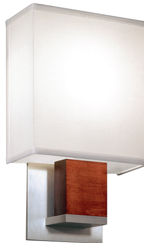
Union Single Sconce UNI1-WM-BAMH-CS