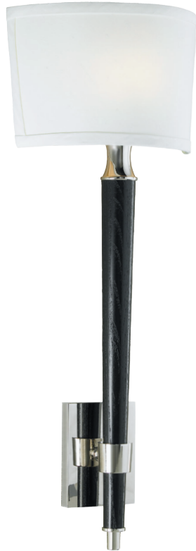
Firenze Single Sconce FIR-RT-CS-PN shown with rectangle backplate