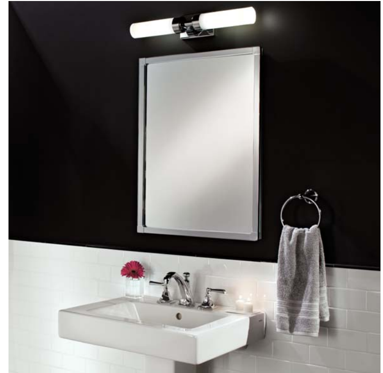
Side Mirror Kit SMK4-30 Order for Surface Mount

Mirror Area Inside Frame 13 1/8" x 28 1/8"