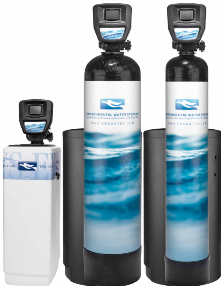
RT1035 (Cabinet Style for Limited Use or Hot Side Only)

If you have had a softener before and prefer the “slippery feeling” and the perceived benefits of softened water, this system option may be best for you. Be aware that softeners strictly soften the water and are not filtration systems. The softening process (ion exchange) substitutes or exchanges the naturally found calcium and magnesium minerals for sodium or potassium chloride (salts).