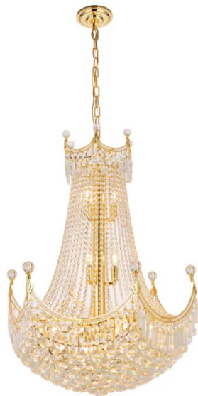
Gold Item No:V8949D24G