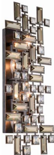
Dark Bronze Item No: V2100W22DB