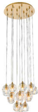
Gold Item No:3505G15G