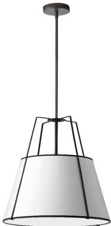
1 Light Trapezoid Pendant Black White Shade with 790 Diffuser

Height 19.5 Width/Length 18 Depth 18 Weight 6