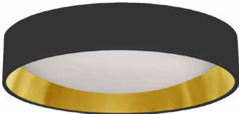
15" Light Flush Mount Fixture Black/Gold Shade